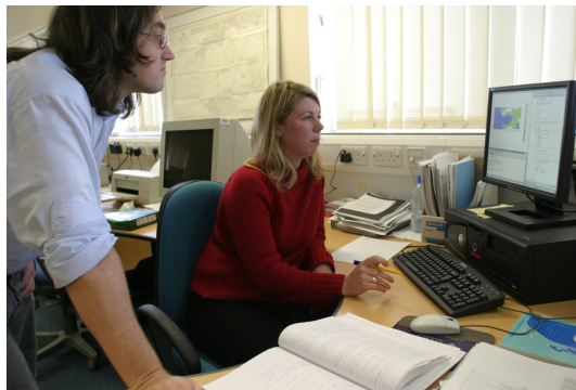
Scientists from Plymouth Marine Laboratory working on model development

Finally, MEECE will provide methodologies to evaluate the performance of the new decision making and management tools developed by the project.