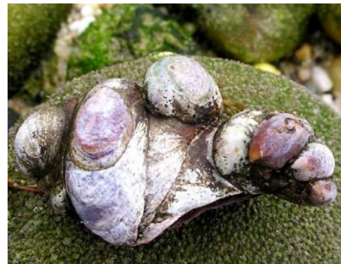
The slipper limpet, Crepidula fornicata . Originally from North America, those snails colonized a large part of the European coastal waters, where they compete with oysters and other shellfish for food.

On an EU scale, BINPAS is the first example of such a development.